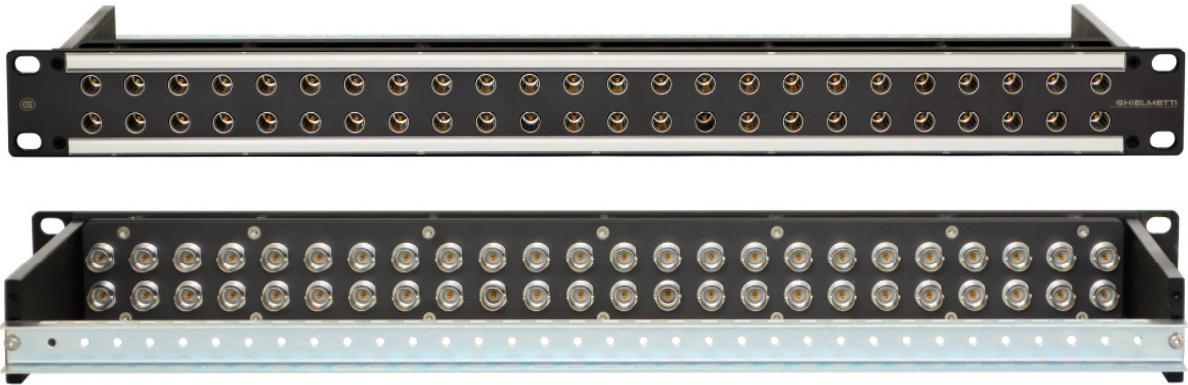
GVP 2x24 A 1/1 MUDIGSA an 677.110.031.51